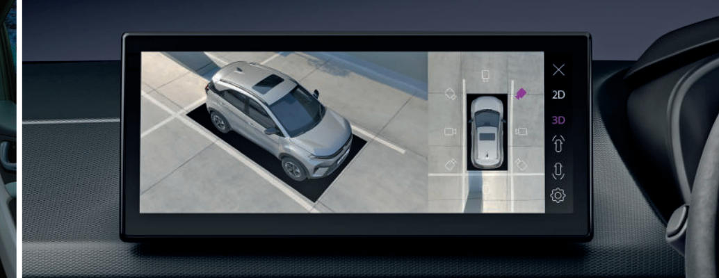
360° SURROUND VIEW SYSTEM WITH FRONT PARKING SENSORS Enjoy an all-round view with Blind View Monitoring