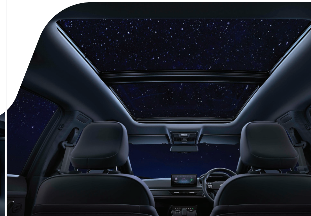
ELECTRIC PANAROMIC SUNROOF WITH VOICE COMMANDS Your words, our command