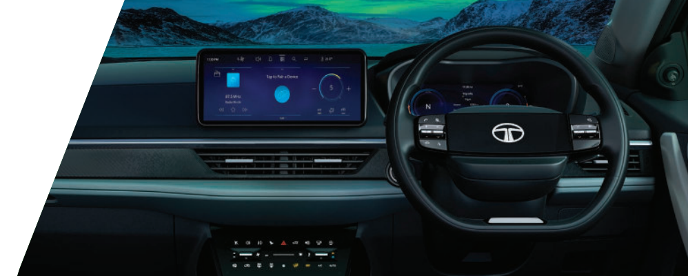
10.25" FLOATING INFOTAINMENT SYSTEM BY HARMAN™ Big entertainment is a big mood