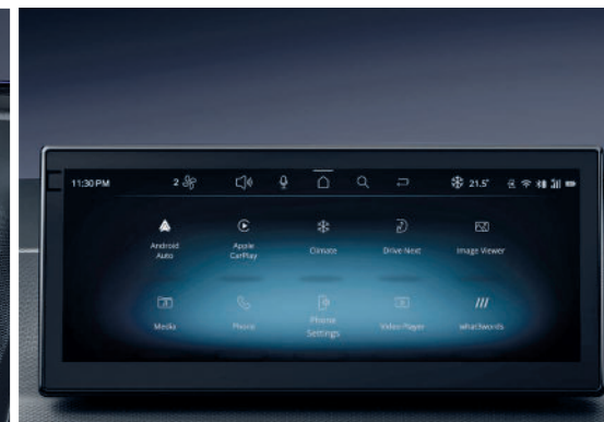
Android Auto and Apple CarPlay with wireless connectivity