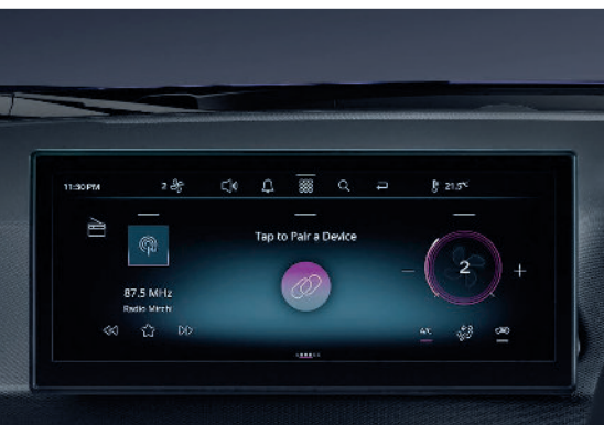
AudioWorks Surround yourself with cinematic entertainment on the move