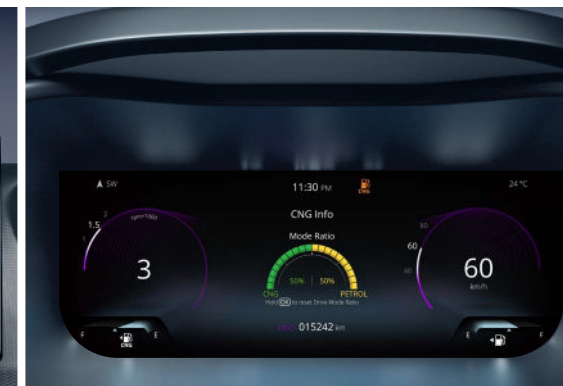
10.25" Digital Instrument Cluster with Driver Attention Assist Never let your guard down