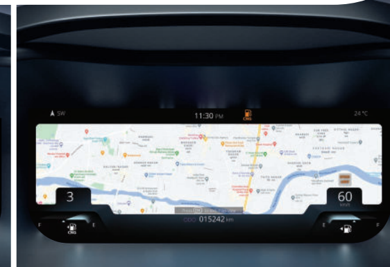
Navigation Display on Instrument Cluster