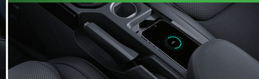
WIRELESS CHARGER Power-up hassle free